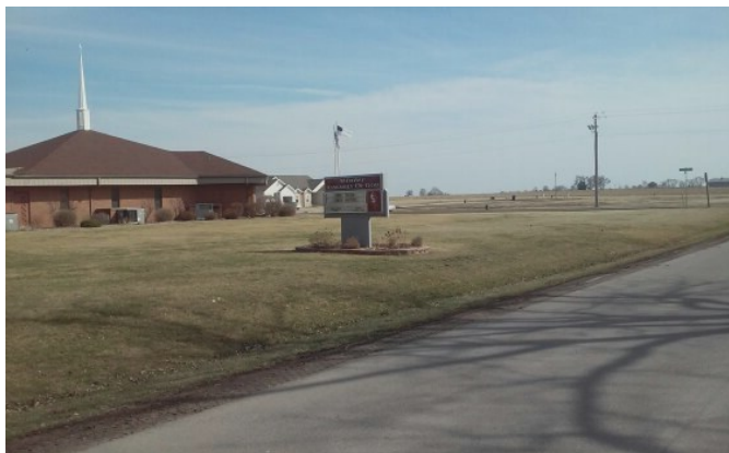
Minier Assembly of God, Minier, IL

To our new friends in Minier....I know everyone who receives this newsletter will be praying that the Lord will direct your steps. We're all in this together! To those whose giving and prayers make these trips possible, we humbly thank you for believing in the work we do.