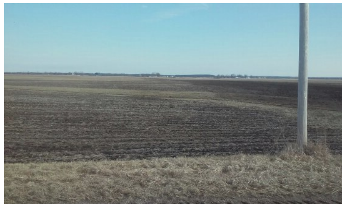
Even here in the heartland. How will you respond to the issues the Lord has placed before you?